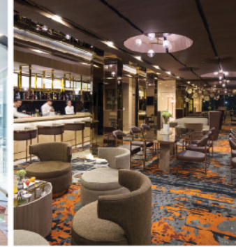
On the Rocks Bar