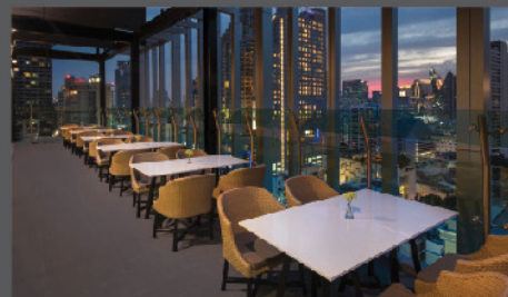
Club Sky Lounge