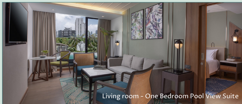
Living room - One Bedroom Pool View Suite