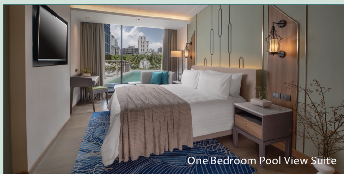
One Bedroom Pool View Suite

73/7-8 Sukhumvit Soi 13, Bangkok 10110, Thailand www.nysahotelbangkok.com